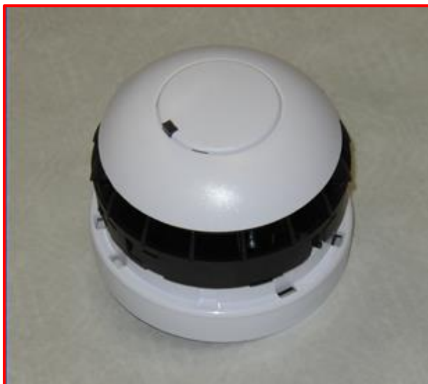
COMBINED Heat and Smoke Detector with Integral Sounder